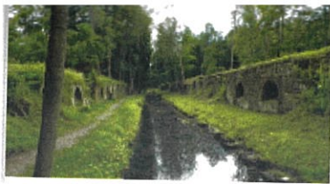
Leetonia Coke Ovens