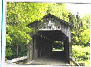
Teegarden Centennial Bridge