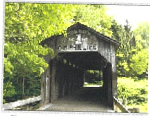
Teegarden Centennial Bridge

P ♿ Teegarden Centennial Bridge Parking Lot GPS N 40.82203 W 80.82724